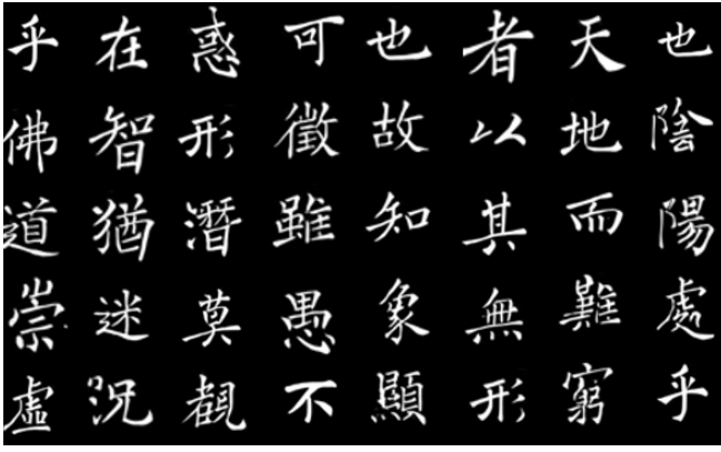
(a) generated work