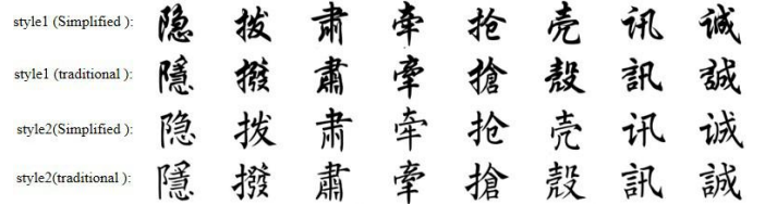
Fig. 4. The generation results of traditional Chinese characters by learning style from simplified Chinese characters.

The multi-style transfer model can generate the font of traditional Chinese characters by learning style from simplified Chinese characters. We randomly select 1500 simplified characters from different font libraries as training data. After training the model, we let the model to generate these types of traditional characters. The generated results are shown in Fig. 4. The simplified characters are already exist in the font library, and we generate the fonts of traditional characters corresponding to these simplified characters.