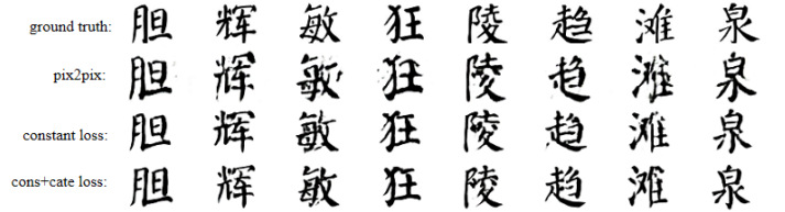
Fig. 2. The generation results of the model introduce / not introduce the constant loss function and category loss function.

To solve the above problems, we rebuild our generative model structure. As shown in Fig. 1, the reconstructed generative model G is composed of two parts, one is