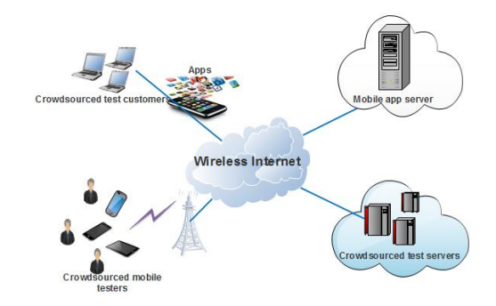
Figure 1. Crowdsourced Test infrastructure

Kenian Wang School of Airworthiness Civil Aviation University of China Tianjin, China wangkenian@126.com