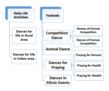
Figure 2. The sub-schema of festival dances and daily life dances

dances for urban areas is the scenes of the modern life to reflect the bad activities from the young generation. It extracts the dark background in the city to admonish their children (the adjacent generations). More importantly, almost all the dances regarding life of urban area is belonged to Kinh ethnic group.